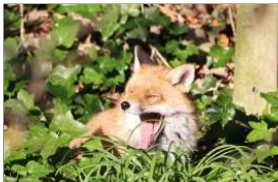
This little lad was sent in from St. Mar's Camera Soiree