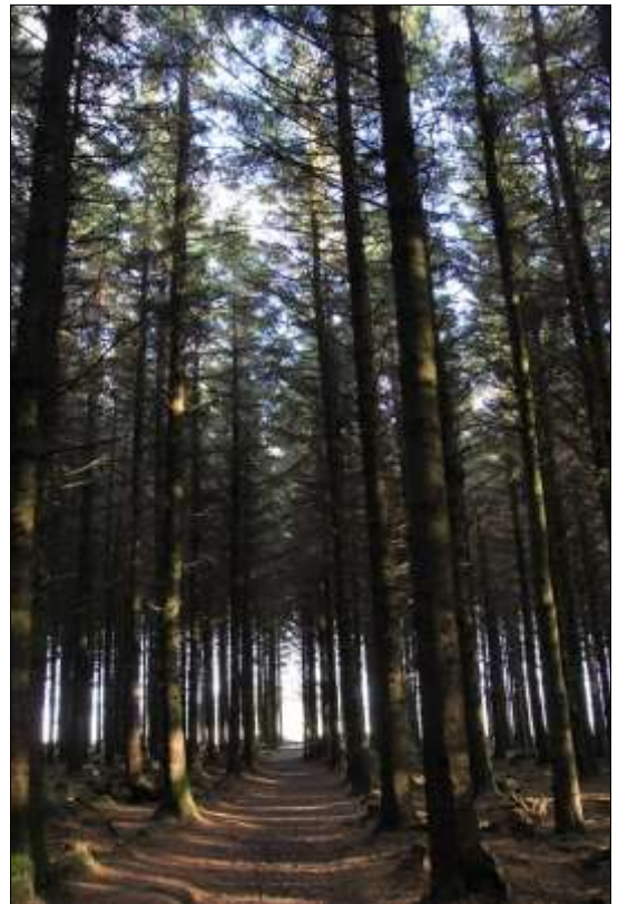
Another delightful scene from St. Mary's Camera Soiree.

Voices of Spring Choir Wed 11am – People living with dementia, carers, older people with other health concerns or who are living in isolation/in need of social outlets.