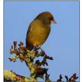
Until next week stay safe!

He also sent us a beautiful photo of a Green Finch, in Irish Glasán Darach. According to the Birdwatch Ireland website the bird is an Irish resident and is one of the top twenty of Ireland's garden birds.