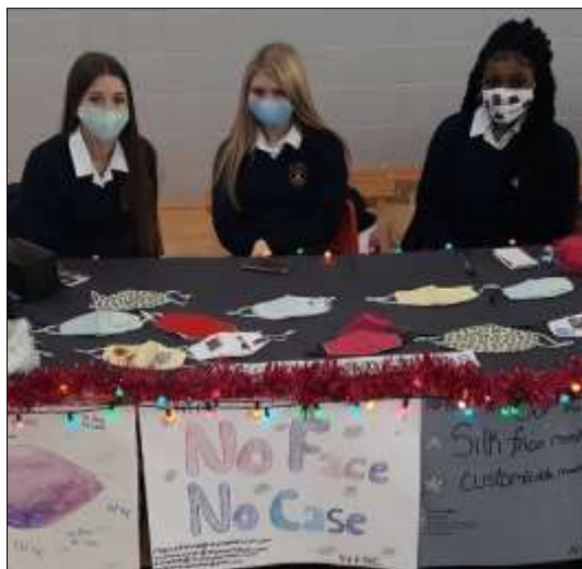
Students displaying their Student Enterprise products at the Christmas Fair

St. Joseph's Transition Year Students taking part in the Student Enterprise Competition are getting ready to pitch their products to the judges over the next few weeks. The TY Enterprise competitions will take place on March 12th and the girls are finalising their Booklets and products at the moment. We wish them all the very best!