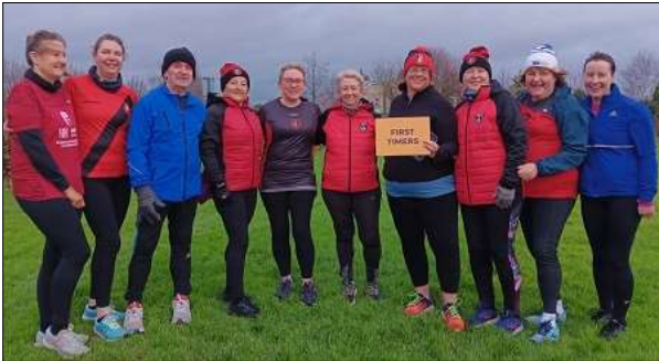
Original Fit4life members from 2014

Lucan Harriers Fit4life 10th Birthday Parkrun celebration: Lucan Harriers Fit4life group met up at Griffeen parkrun to celebrate its 10th birthday on January 20 th .