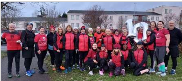
Lucan Harriers 2024 members

A dull grey Saturday morning in Griffeen Park, with the typical morning tranquillity broken at 9am by the arrival of a troop of Lucan Harriers who were out to celebrate Fit4Lifes 10th Anniversary! Photos were taken and memories shared as friends from times gone by reminisced! And then the run began!