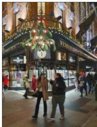
Novice. Street Scene December 2023 - Linda Ffrench.