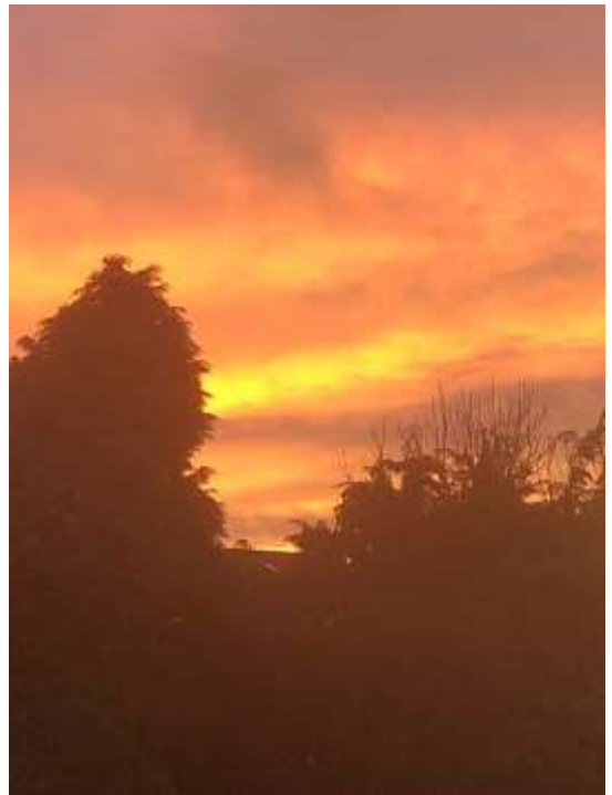
A January Sky over Lucan