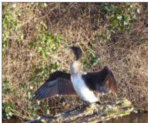
Wild life in Lucan Demesne – a Cormorant me thinks!

The above verse, When The Song of the Angels is Stilled was set to music and is performed by choirs all over the world.