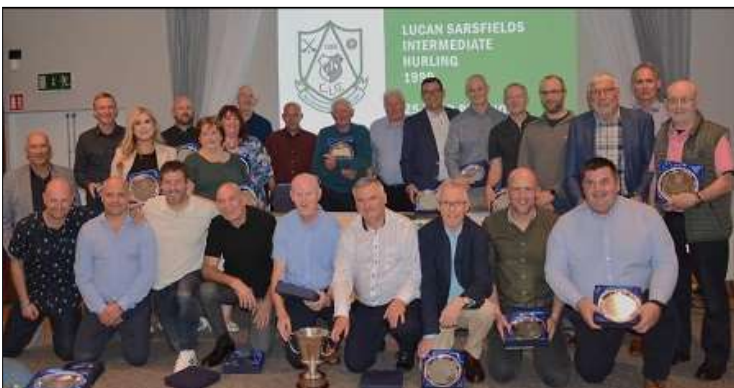
Photo below of 1999 Intermediate team & mentors at the reunion

The action on the field this week was at Minor level as the leagues come towards conclusion. Our Minor As had a big win away to Kilmacud