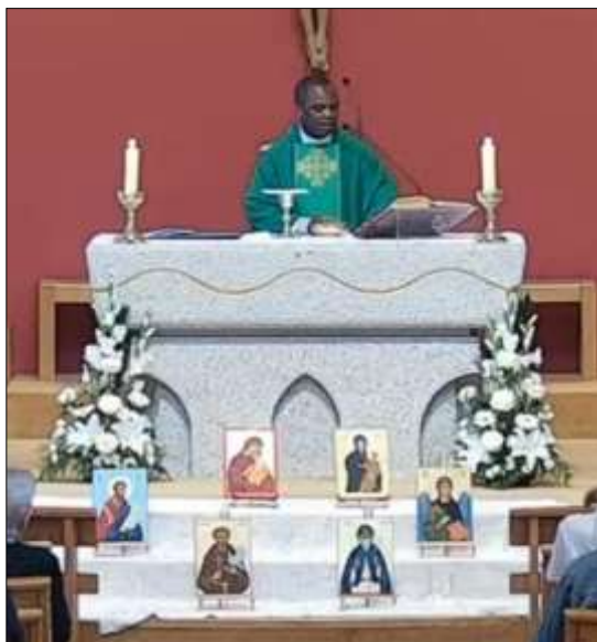
The new Icons were blessed at the Vigil Mass in St. Mary's, on Saturday last.

These iconography courses and workshops play a crucial role in preserving an ancient and beautiful tradition, one that traces its roots back to St. Luke the Evangelist.