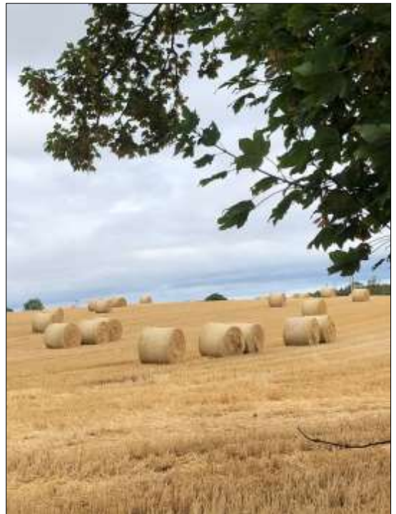
Beautiful picture of the hay gathered for another year, at Westmanstown.