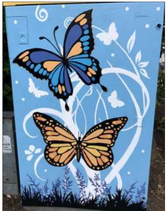
Another delightful Dublin Canvas , this time at the junction of Millstream Road/Woodview Heights. Unfortunately, we missed the artist this time!