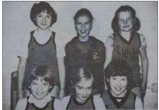
Above: An Under 10 Girls Team.

While the new athletics track was under construction, the club were very busy with events in all age groups.