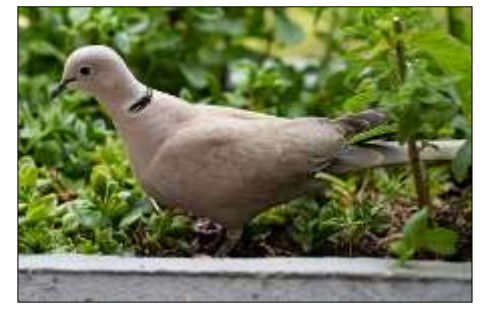
Until next week stay safe!