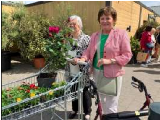
Some of our members on a recent trip to the Arboretum, where all enjoyed a great day.

Wednesday 17 th June – Social Morning from 10.30am to 12.30pm, in St. Mary's Parish Centre.