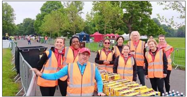
Lucan Harriers volunteers at BioFreeze 5k

Lucan Harriers really excelled at the volunteering with the finish line totally manned by the club. They presented the medals, and distributed water, bananas, protein bars & the blue drink congratulating all 1693 finishers and taking the social media photos for so many.