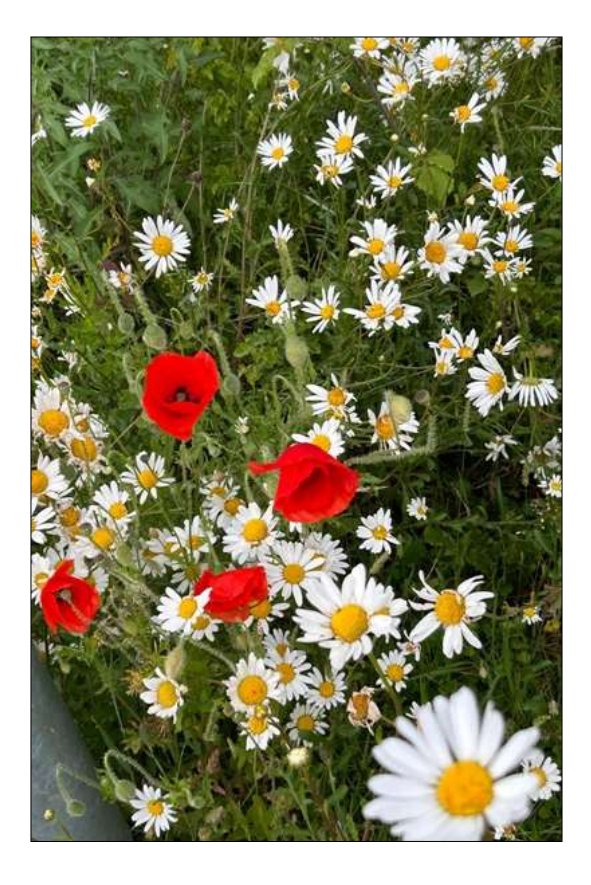
Wildflowers of Lucan

Nonetheless, there are interesting and exciting times ahead for this historic site.