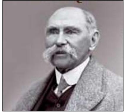
President Douglas Hyde

Four years earlier, Douglas Hyde was installed as first President of Ireland. At the time, the British National Anthem still featured in some ceremonies involving the Church of Ireland. As Dr. Hyde was a member of this Church, there were always fears that the said anthem would be played at events, thus causing a snub to the office of the Presidency of Ireland.