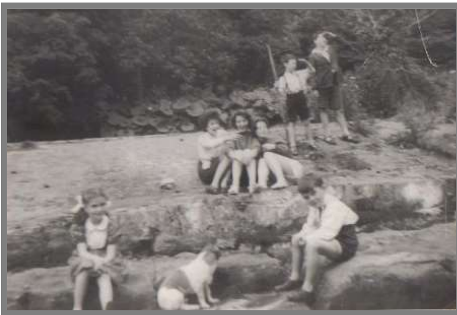
Left: A hot summer's day in July 1961 – while the rest of the world was discovering hippies and 'flower power', this group of local children were having fun at the weir.