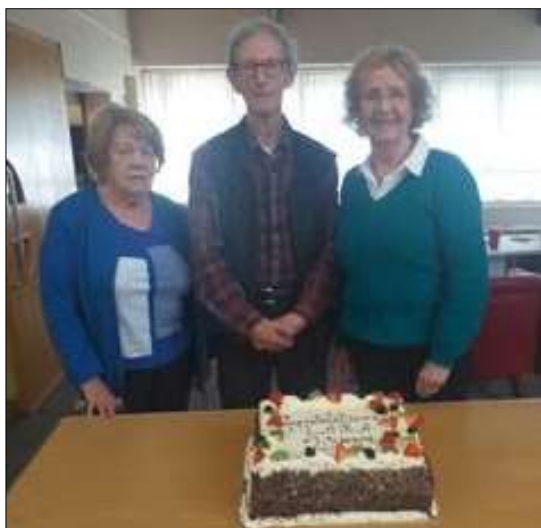
Founder Members of Lucan Active Retirement Association.