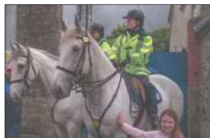
Garda Station open Sunday 10 th