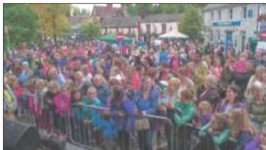
Main Stage Sunday 10 th