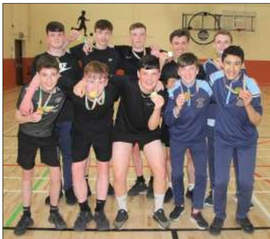
3 rd Year Marathon Winners

Soccer: A 5-a-side soccer marathon was held in the school last Wednesday. Teams from 1 st , 2 nd and 3 rd yr competed for bragging rights among their respective year groups on three pitches, two outdoor and one indoor, with the marathon beginning at 6am and running until 7pm. In total, over 180 games took place with almost 200 students taking part and over 1,800 goals scored!