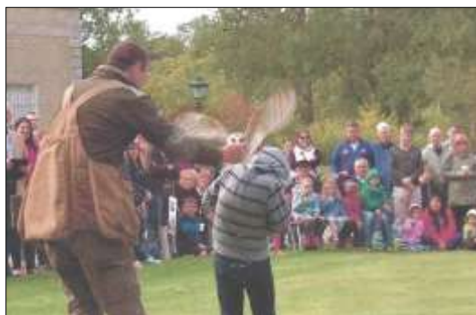
Bird Show Saturday 9 th

Things to look forward to next September!