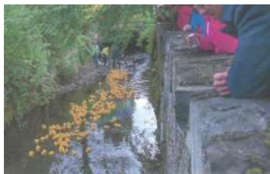
Duck Race Sunday 10 th