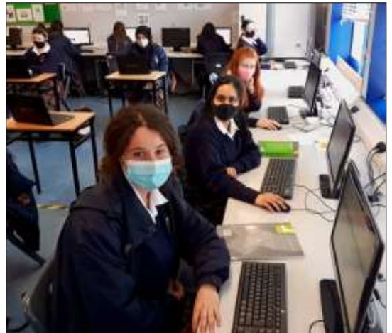
5 th year students preparing to sit their ECDL exam