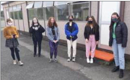
Students arrived 'non-uniform' on Tuesday to support our fundraiser for an outdoor classroom!