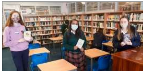
Students borrowing a book from our school library