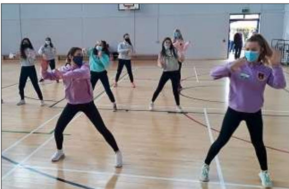
Transition Year students keeping fit and having fun during Zumba Class on Wednesday

Members of our Student Council attended the Ceist Student Council / Student Leadership Gathering this week. The event was held online and featured a presentation by Prof. Luke O'Neill, TCD. This was the first ever virtual gathering of Students from CEIST schools all around Ireland. It was a wonderful opportunity for our student leaders to hear the advice & encouragement of Prof O'Neill.