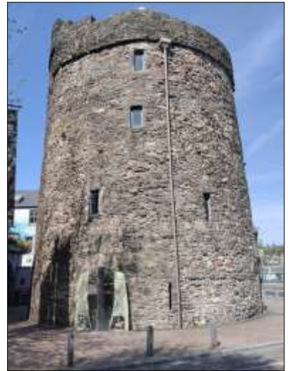
The oldest parts of Malahide Castle date back to the 12th century.

This week Joe sent in photographs of Reginald's Tower in Waterford city and of Malahide Castle. The present tower is likely to have been built in the 13th or 14th century, probably between 1253 and 1280. Down the centuries the tower has been used as a mint, a prison, and a military storehouse. In 1861, it became the property of the Waterford Corporation, and the residence of the Chief Constable of Waterford. It continued to be inhabited until 1954. Today it houses the Waterford Viking Museum and exhibits many of the archaeological finds from the 2003 dig at Woodstown on the River Suir.