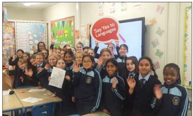
Ms. Connolly's 4 th Class

A suite of resources has been produced including lesson plans for teachers and tutors and 'Language Passports' for all participating pupils to show their family and friend. Packs have been sent to participating schools to help support both the teaching and learning, but also awareness raising objectives of the module. More information regarding the modules, tutor expression of interest and supports are available at www.languagesconnect.ie/primary