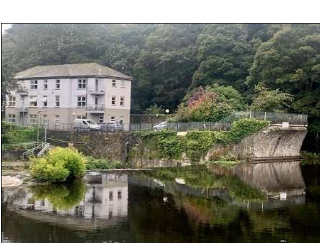
Until the next time stay safe!

Josie has submitted photos from around Lucan. The Liffey looks quite full after all the rain. I particularly like her photographs of a flooded pathway in which she has captured the reflections of the trees and sky in the water.