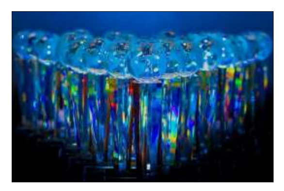
Intermediate. "Prizm - Dominic Gaffney".