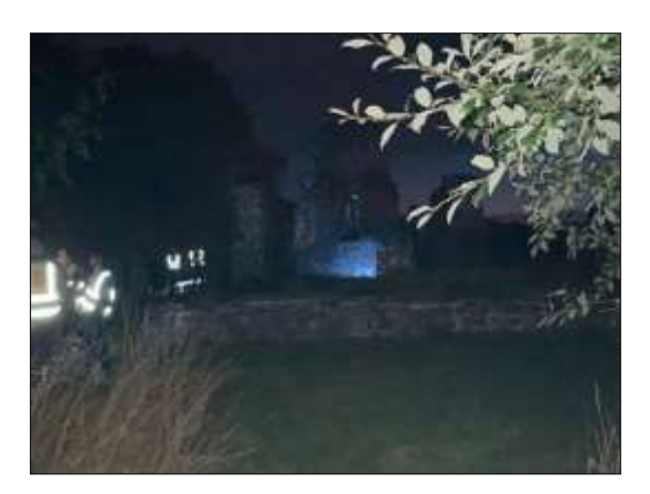
Hi vis vests and photography at night at St. Finian's

The event turned out to roaring success attended by Lucanians young and old, not only in age but in tenure as not only did we have families who recently moved to Lucan and were eager to learn about their new home, we also had a lifelong Lucanian with 3 generations of her family buried at St. Finian's.