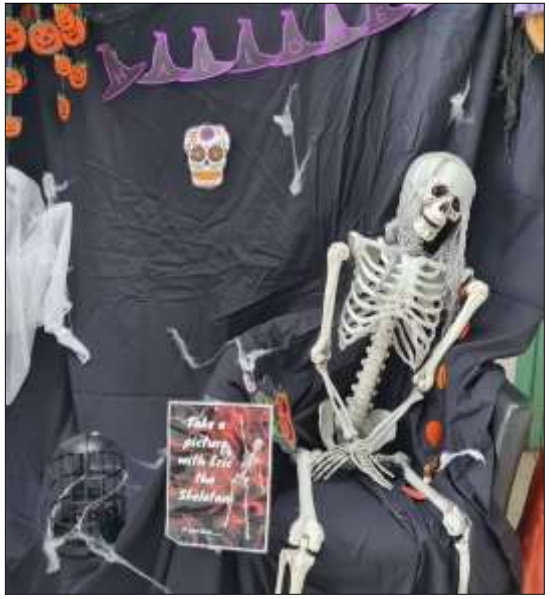
Scary times at Lucan Library!