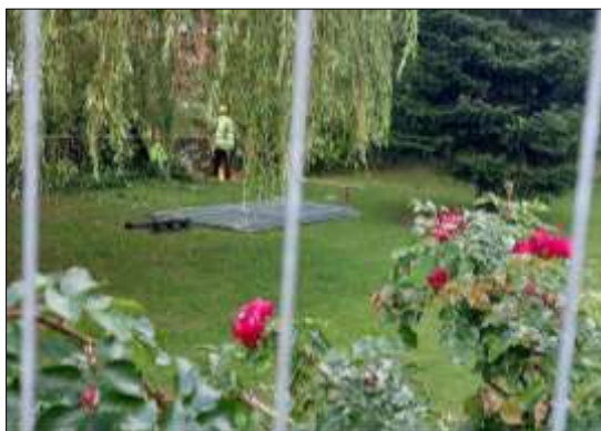
One of the first jobs here appeared to be the cutting away of some of the Griffen railing.