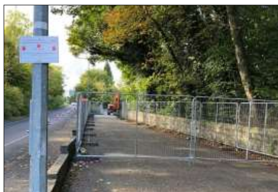
The Demesne entrance blocked off but access is still provided for walkers.