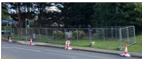
We understand that the above space will become the new car park – wouldn't have thought there was a lot of space, but time will tell!