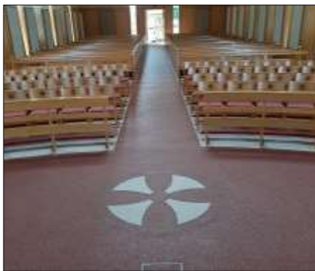
The new floor at St. Mary's – a lifetime job!!

Masses live-streamed on www.lucanparish.com