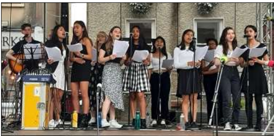
Aontas Choir on stage at the festival

Although Sunday started out with heavy showers, the weather did improve substantially, and there was a great atmosphere in the village.